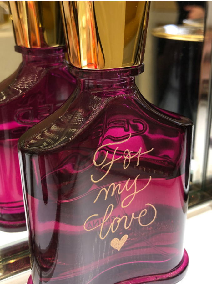
▲ Live In-Studio ▶