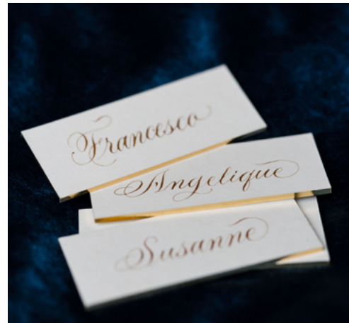
◀ ▶ Personalisation